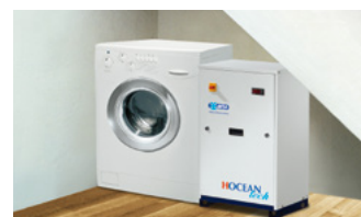
Allows installation in even the most limited spaces.