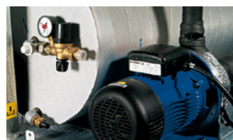
Separate storage and pump module with two pump versions.