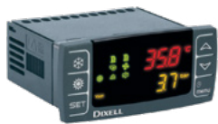
Microprocessor controller with dual icon-based display.