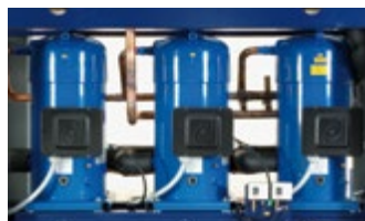
Optimised performance thanks to multiscroll logic.