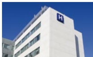
Ideal for air conditioning of civil, public and private buildings.